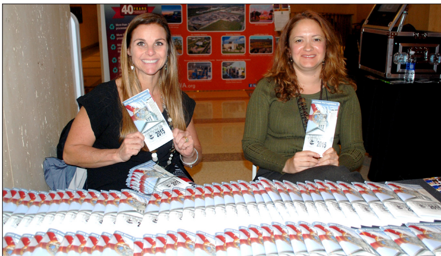
The Palm Beach County booth distributed "Know Your Legislator" guides.

Don't miss out on the opportunity to be involved in this important effort to bring state tax dollars back to Palm Beach County to address our most important issues. Register to attend Palm Beach County Day, today.