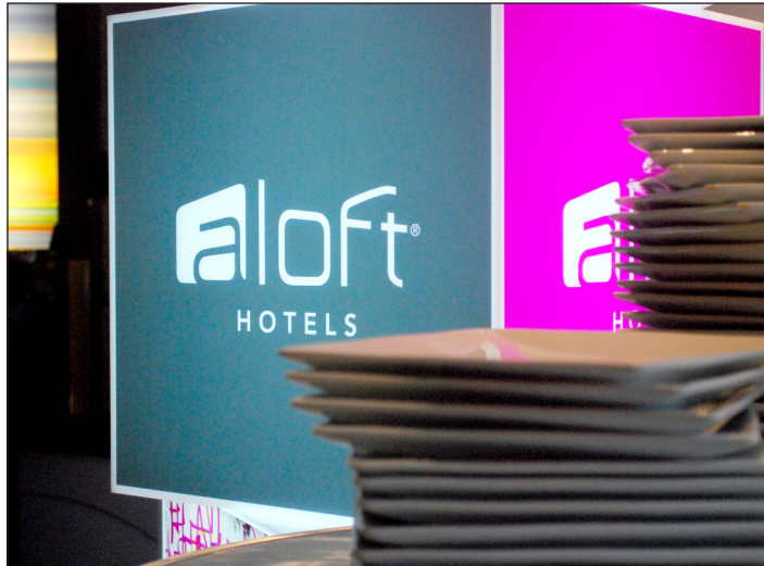
PBC Day 2015 Breakfast at the Aloft