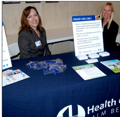
The Health Care District exhibit

For many years at Palm Beach County Day, organizations have had the opportunity to create an exhibit in the Capitol Rotunda that promotes their organization. This is a great opportunity to get your organization's message out to the many Palm Beach County Day participants who are visiting Tallahassee. Many of these attendees to the various PBC Day events are the "movers and shakers" of the county, and most likely, decision makers. This is an ideal audience for any organization hoping to make an impact on the county as well as the lawmakers in Tallahassee. One eight foot table and two chairs are provided by Palm Beach County Public Affairs to any attendee who would like to have an exhibit in the Rotunda. The space is reserved, but call now to make sure you have a spot. Please contact PBC Public Affairs at (561) 355-4125 or e-mail castephe@pbcgov.org .