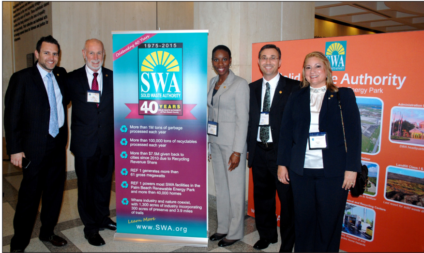
Solid Waste Authority putting the final touches on their PBC Day exhibit.

For many years at Palm Beach County Day, organizations have had the opportunity to create an exhibit in the Capitol Rotunda that promotes their organization. This is a great opportunity to get your organization's message out to the many Palm Beach County Day participants who are visiting Tallahassee. Many of these attendees to the various PBC Day events are the "movers and shakers" of the county, and most likely, decision makers. This is an ideal audience for any organization hoping to make an impact on the county as well as the lawmakers in Tallahassee. One eight foot table and two chairs are provided by Palm Beach County Public Affairs to any attendee who would like to have an exhibit in the Rotunda. The space is reserved, but call now to make sure you have a spot. Please contact PBC Public Affairs at (561) 355-4125 or e-mail castephe@pbcgov.org .